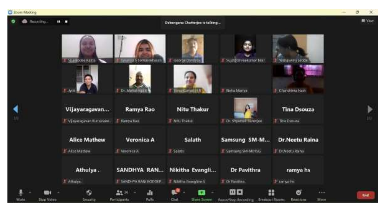
Participants during the panel discussion