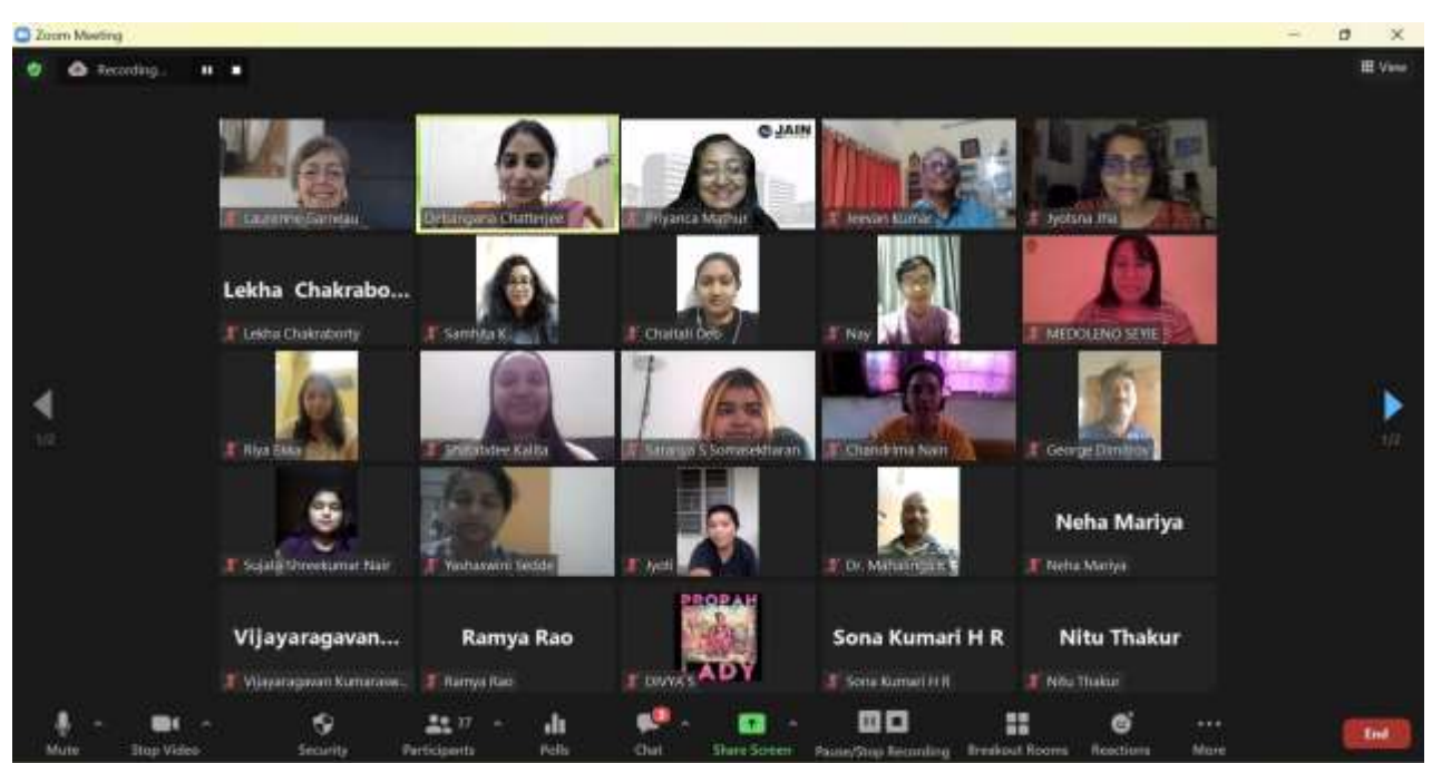
Participants during the panel discussion